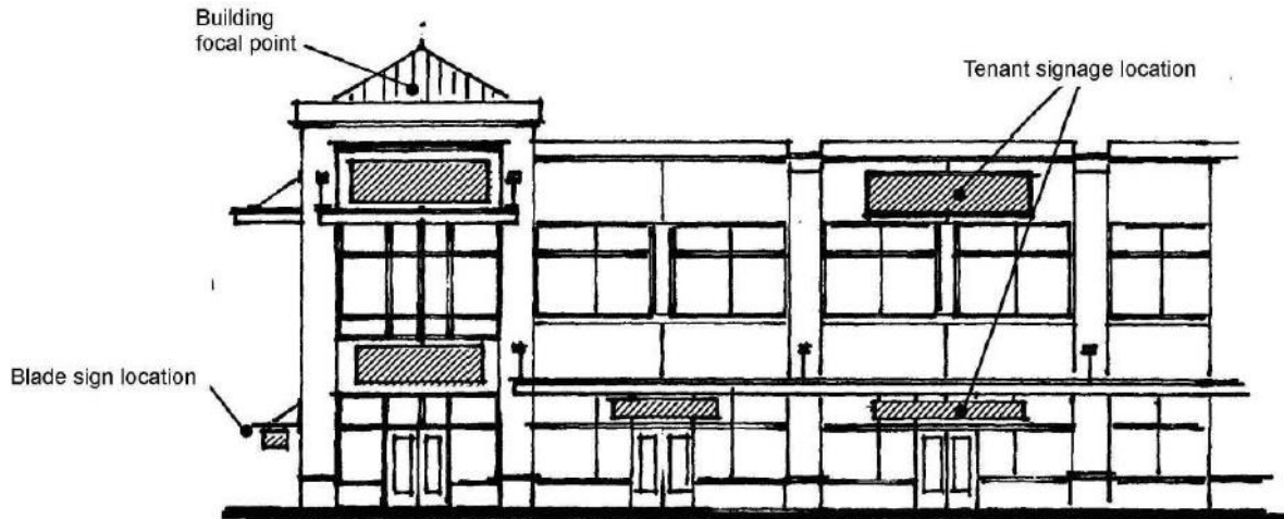
Figure 2. Appropriate sign location and size