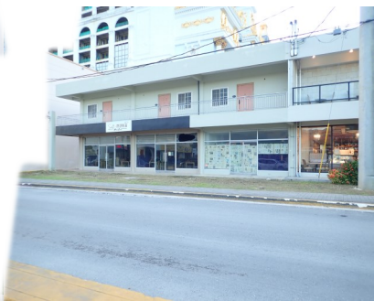
...after clearance of overgrown vegetation