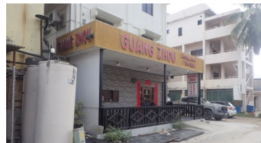
Ongoing enforcement on public nuisance