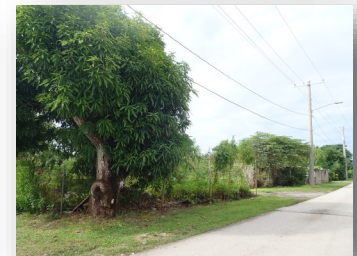
...after clearance of dilapidated fence