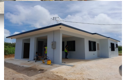
Completed residential structure