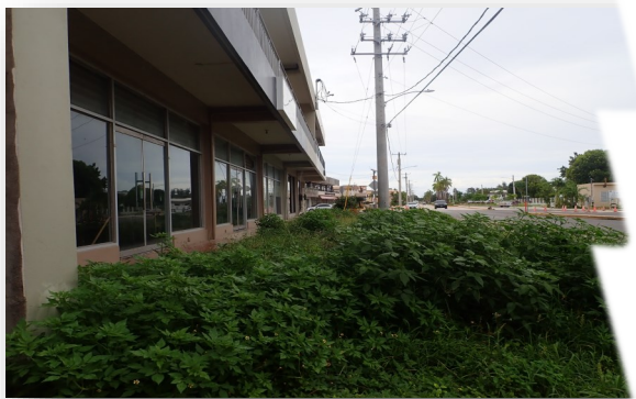
Commercial Building (before)