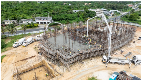
NMC Student Center